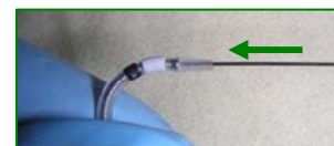
Figure 2. Guide wire insertion into electrode end of lead.