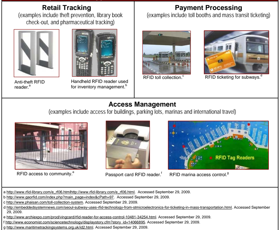
Table 1. Examples of RFID Applications